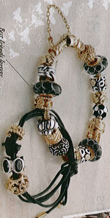
Best friends forever